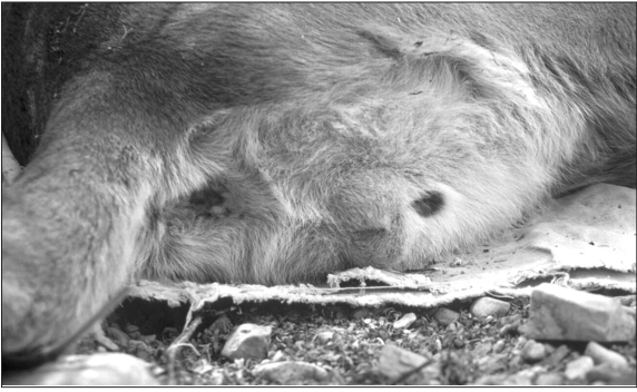
Male mountain lion hindquarters