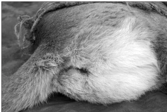
Female mountain lion hindquarters